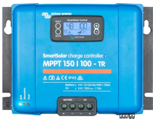
Solar Charge Controller MPPT 150/100-Tr with pluggable display