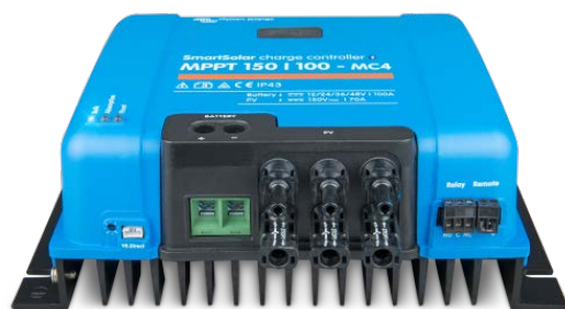
Solar Charge Controller MPPT 150/100-MC4 without display